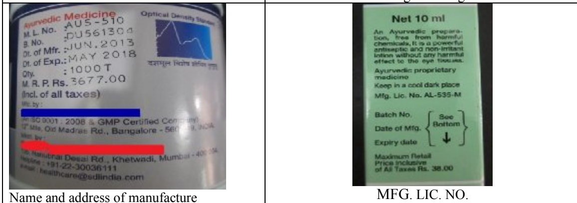
Name and address of manufacture