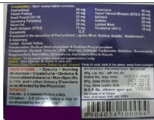
Caution mentioned in label