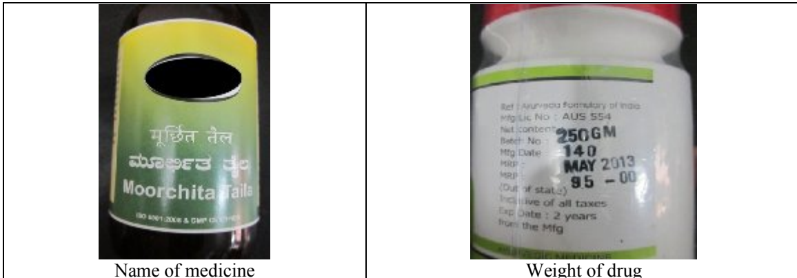
Name of medicine