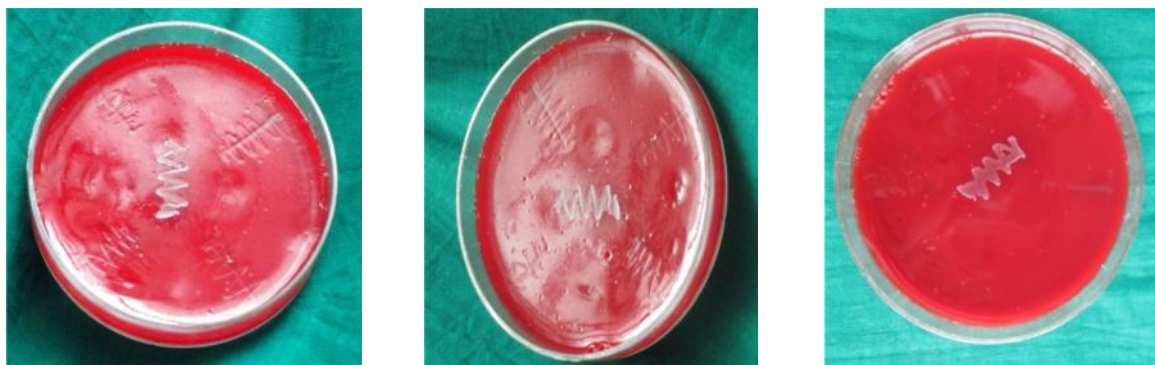
Fig.4a, 4b, 4c: Disinfection of K files checked by blood agar plate streaking method: (a) 0.5% w/w Garlic oil, (b) Pure Clove leaf oil, and (c) Autoclaving