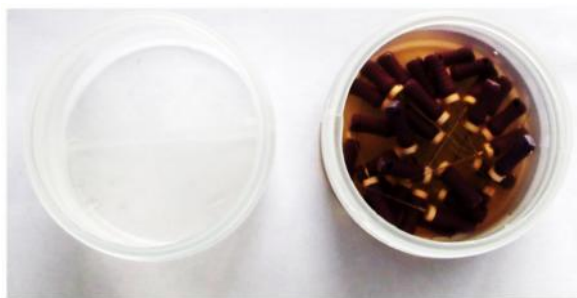
Figure 1: Endodontic files infected by placing in Enterococcus faecalis broth for 30 minutes.

Figure 5d: Disinfection of K files checked by microscopic examination method after autoclaving