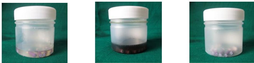
Fig. 2 a, 2b, 2c: Disinfection of E. faecalis infected K files (a) 0.5% w/w Garlic oil, (b) Pure Clove leaf oil, and (c) Autoclaving