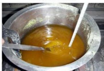
4 Melted Gandhak & Goghruta after stonelike structure Gandhak