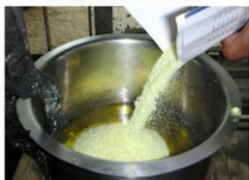
2 Adding Powdered Gandhak in melted Goghruta