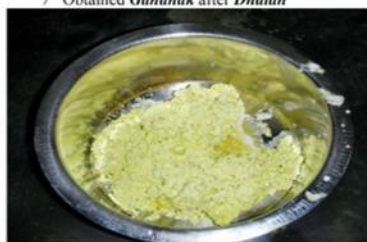
8 Shuddha Gandhak after Dhawan (Wash)