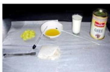
1 Raw Materials Taken for Gandhak Shodhan