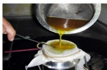
5 Pouring of melted Gandhak & Goghruta in Godugdha

as described by Ayurved Prakash. But as material quantity changes may cause procedural observations changes regarding time, structural form of drug as well as therapeutic indications of drug. Hence this present study was taken on the basis of observational study during shodhan process for above two methods having different quantity of goghruta . Gandhak has many therapeutic indications mostly for skin disorders as it has best antimicrobial action especially against fungal infections. It is largely used drug for preparation of many formulations in Rasashastra . Many methods and materials are mentioned in classical texts of Rasashastra in which