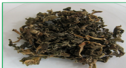
Plate No 1- Basella rubra linn. Leaves Powder Plate no.2 Dry Leaves Plate no.3 Dry Leaves