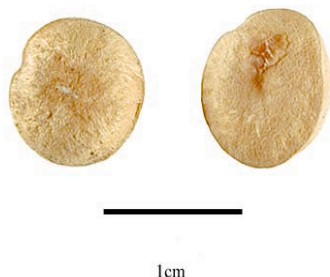
Fig.: 1] Seed of Strychnos potatorum (Katak)

16. Shanti Bhushan Mishra, Phytochemical Analysis and History of strychnos potatorum L. Seeds, Hygeia J.D. med. Vol.6 (2) oct14-march 15 page 17 -20