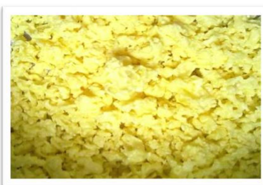
Image no. 2- Shuddha Gandhaka