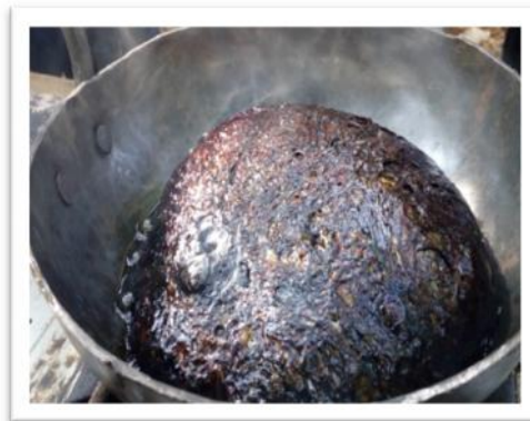
Image no. 6- Formation of Katu Taila Gandhaka dome over pishti.