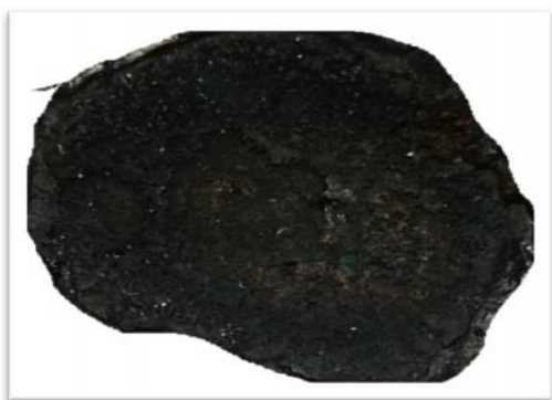
Image no. 7- Pishti after agni paaka