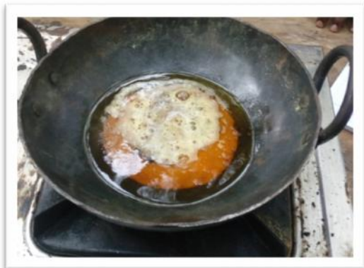
Image no. 5- Tamra dhatu pishti paaka in katu taila amidst two layers of Shuddha Gandhaka.