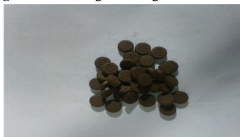
Image no. 8- YMR tablets