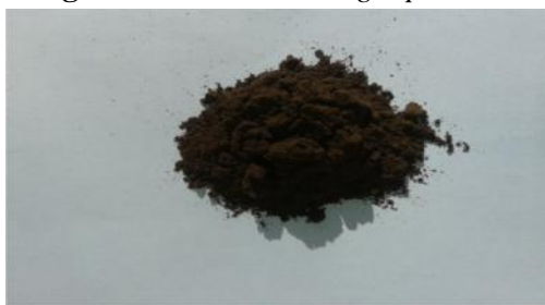
Image no. 7- YMR homogenous mixture Obtained after mixing all ingredients