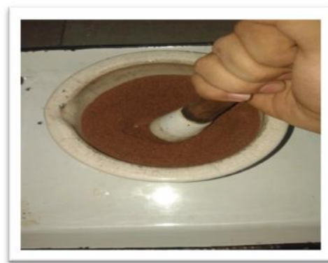
Image no. 8- Mixing of all ingredients