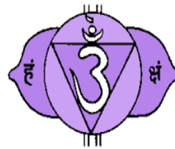
Fig.1 Ajna Chakra Purpose and function of the sixth Chakra