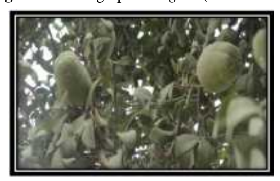
Unripe fruit of Ingudi