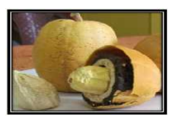
Fruit with seed