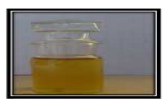
Ingudi seed oil