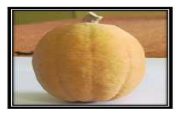
Single fruit of Ingudi