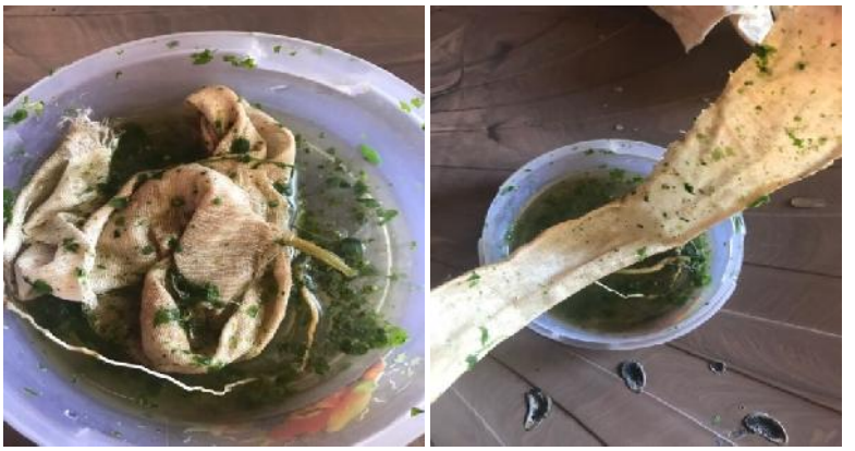
A cloth dipped in the Swarasa