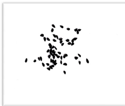
Fig- 2 Upakunchika seeds

contaminations such as earth, stones and extraneous material. Foreign matter is material consisting of any organ or part of organ, other than