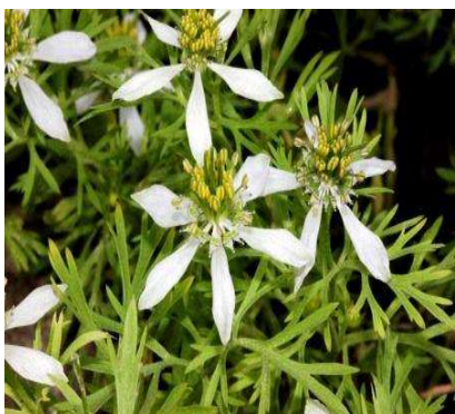
Fig- 1 Upakunchika plant

As Nigella sativa Linn. is a miracle herb, there is a need to analyze its physico chemical and phytochemicals. Upakunchika is one of the easily available, cost effective drug and having many actions against different diseases. So, the drug was selected for the study. The Physico chemical analysis gives us knowledge and proof regarding quality. Preliminary Phytochemical screening will help in knowing various phytochemicals present in nigella seed which are responsible for different pharmacological activities. Different solvents are used to know in which solvent phytochemicals are more available thus it gives further scope in research side. Here an attempt is made to evaluate the Physico chemical and Preliminary Phytochemicals of Upakunchika i.e., Nigella sativa seeds.