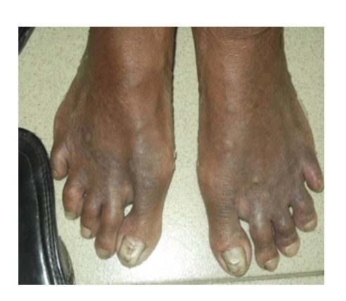
After 4<sup>th</sup> Week

At the end of 4<sup>th</sup> Week, the patient's skin colour was almost back to normal.