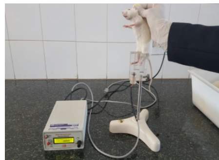
Digital plethysmometer Left plantar