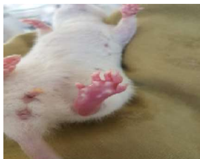
Inflammation after injection