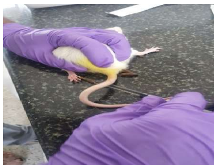
Injection of FCA into

Experimental study proved that Amavatari Rasa in Group V (2 TED) is more significant when compared to Amavatari Rasa in Group IV (TED). With the factual evidence obtained by the above experimental data, it has been concluded that the Amavatari Rasa is having significant anti-inflammatory activity.