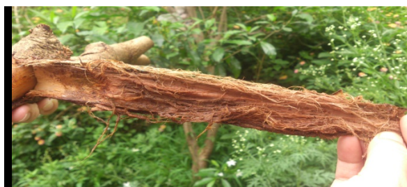
Fibers of Ashman taka achieved after retting.