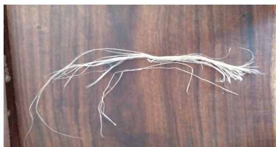
Fibers of Ashman taka after drying