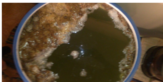
Ashman taka bark immersed in water to achieve retting.

Length: 60cm, Color: Creamish white, Texture: smooth, Tensile strength: 9.1MPa, Breaking Load: 10.4 Elongation (%): 1.85, Diameter: 0.3mm