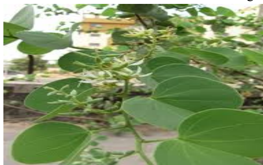
Ashman taka plant

Flower decoction is used in "Cold and Cough".