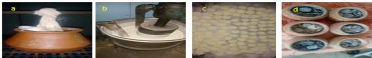
Fig 2 a. Shodhan of Mukta in sudhodhaka b. Bhawna given to Mukta in godugdha c. Chakrika formation d. Chakrika in sarava samputa