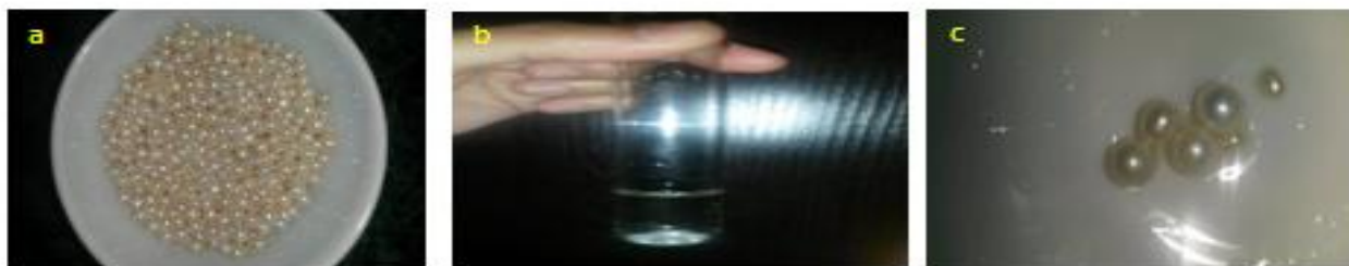
Fig-1 a.Raw mukta b.Patu yukta test for Mukta c.No change after Patu yukta test

Good quality Mukta was purchased from authentic gemstone selling shop from Karnal, Haryana [Fig.1] and testing were done at Ozone Pharmaceuticals Ltd. analytical lab, Bahadurgarh, Haryana [Report 1]. 2 ml of Gomutra (cow urine) was taken in a test tube, 2 pinch of Saindhava Lavana was added and mixed well. Beads of Mukta (Pearl) were dropped in this mixture and kept for overnight. Then Mukta was taken out and rubbed with thick rough cloth [8]. No change in shining, colour as well as weight was observed in Mukta beads after the process. So it can be affirmed that the selected sample is genuine.