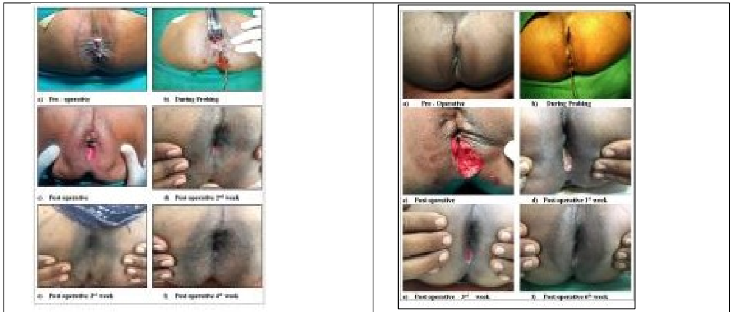
Figure 1: CASE 1