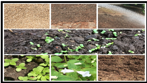
Figure 2 Soil preparation with tila cultivation