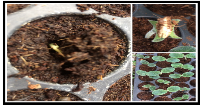
Figure 1 Seed germination