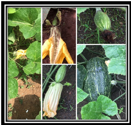
Figure 4 Group A flowering and fruiting