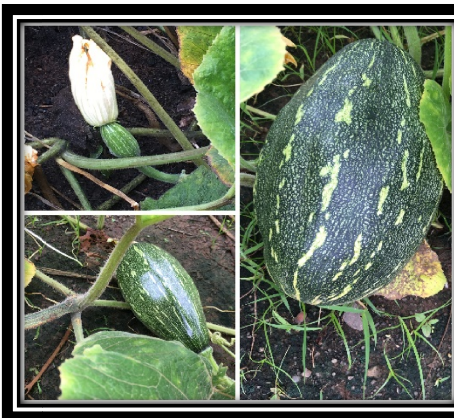
Figure 5 Group B flowering and fruiting