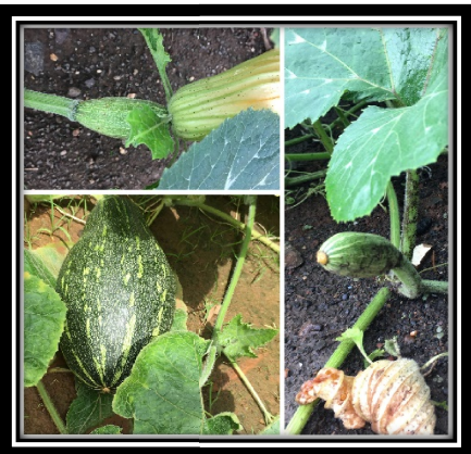
Figure 3 Group C flowering and fruiting