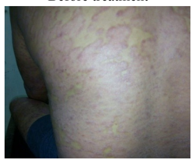
Fig 5: Showing changes after proper Shodhan. Before treatment After treatment