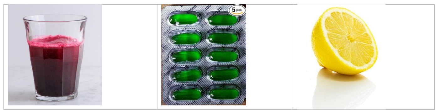
Fig. 2: Herbal ingredients used in Herbal lipstick