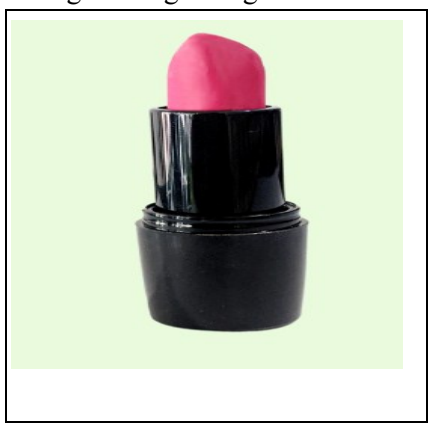
Fig. 1: Herbal lipstick