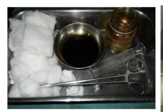
EQUIPMENT FOR UTTARBSTI.