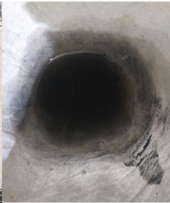
Fig 2: Filtration of Gandhamliya Yashada Jala