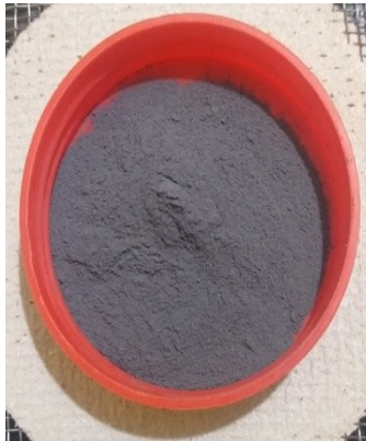
Fig 1: Yashada Churna

pose of study and results can be evaluated.