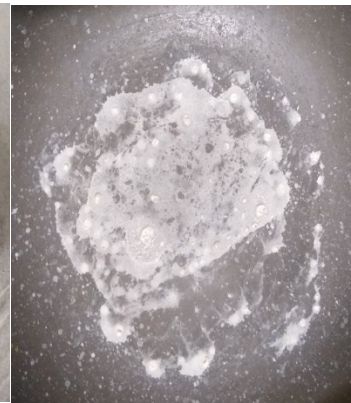
Fig 3: Gandhamliya Yashada Kshara