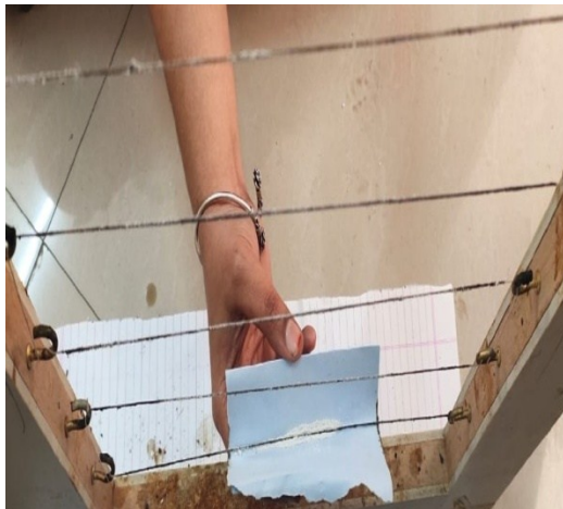
Fig 4: Gandhamliya Yashada Kshara coating