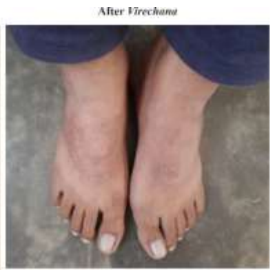
Jaluka-Karma: Jaluka-Karma was done after 7 days of Virechana Karma on 17/10/22.